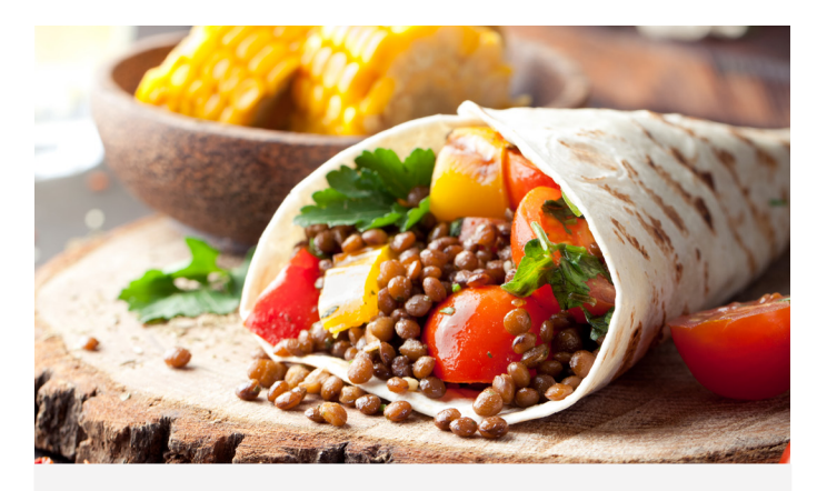
The North America Frozen Food Market will register a CAGR of 4.14% by 2026.

interest in whole grain and multigrain products, which are fueled by innovation and production improvements. These habits are also increasing the demand for products free of artificial ingredients, additives or preservatives.