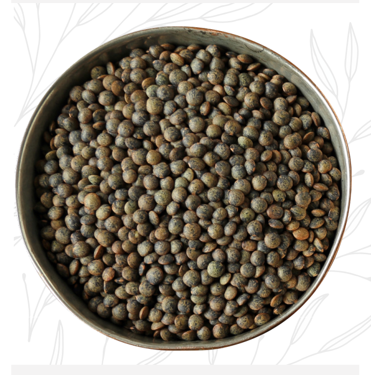
Brown Lentil — great as a salad topper or blended into soups. Mild and earthy flavor.

Black Lentil — delicate taste and fantastic for absorbing other flavors. Black lentils retain shape and have an al dente texture when cooked.