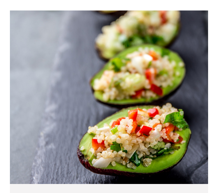
Frozen meals and entrees that are positioned as plant-based have grown 27% more than those that are not positioned as plant-based options.

Foods like grains are an excellent option for avoiding any artificial ingredients or processed foods, while at the same time offering products that meet consumer standards.