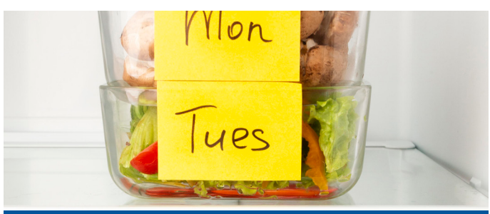
6. Save time meal planning.