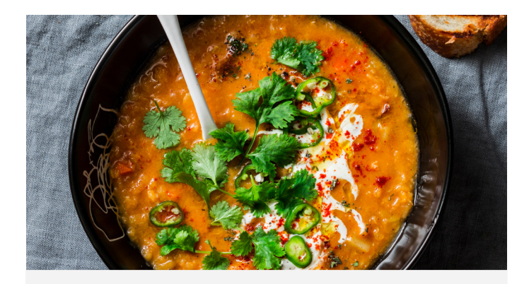
40% of Americans are shifting toward eating more plant-based foods.

In light of this information, IQF items are an ideal choice when it comes to mealtime needs. It supports the growing trend toward more plant-based items alongside the desire to reduce food waste.